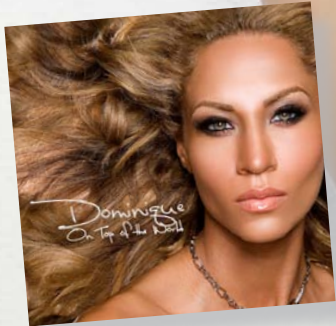
DOMINIQUE'S VIDEO AND SINGLE FOR "ON TOP OF THE WORLD"